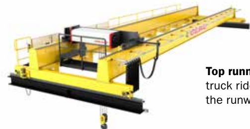
Top running - the end truck rides on top of the runway beam