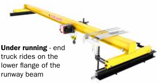
Under running - end truck rides on the lower flange of the runway beam

Double girder - typically allow greater hook height than single-girder designs, as the hoist can be mounted on top of the bridge rather than underneath