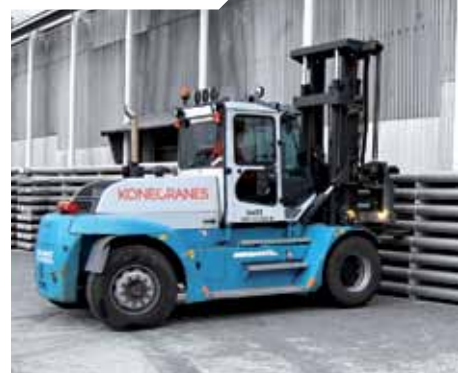
Twin empty stacker, Germany