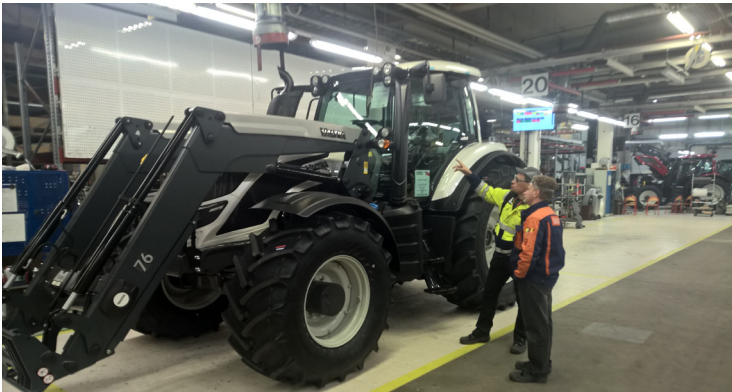
The end product, Valtra tractor.

With the help of advanced production technology, Valtra has been able to increase production output to 34 tractors per shift. This means that one new tractor rolls out of the production line approximately every 13 minutes. At Valtra, their mission is to develop tractors and provide services that make your daily work easier. Valtra is a reliable and innovative tractor manufacturer, which truly operates in accordance with the same high-demanding production requirements as the most of the modern automotive plants.