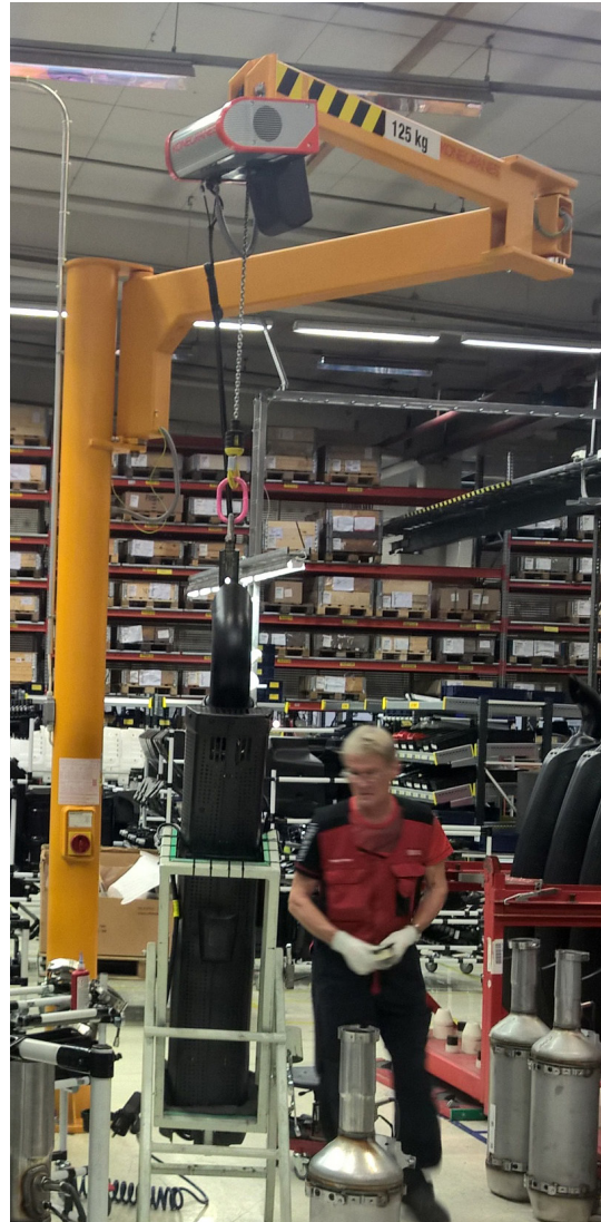
Jib crane with a CLX electric chain hoist.