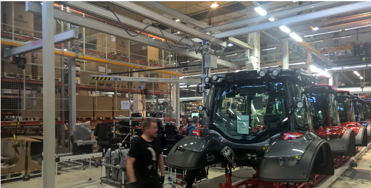
XA aluminium workstation cranes equipped with CLX electric chain hoists at Valtra's production facility.