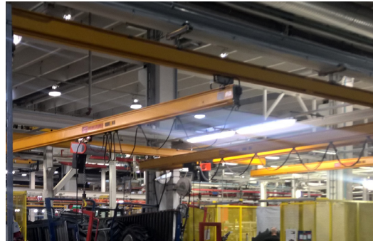
Konecranes XM steel workstation cranes equipped with a CLX electric chain hoist.