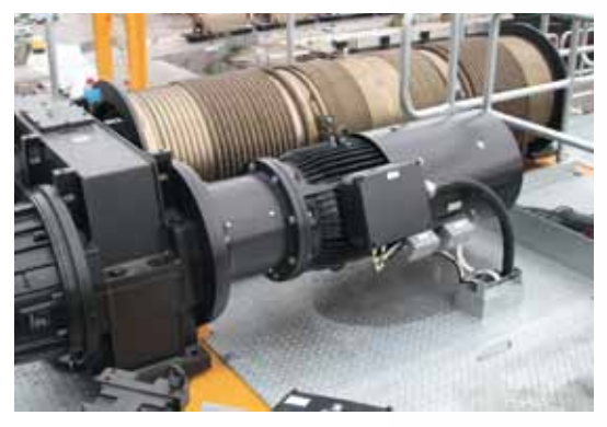
Service modularity for quick and less frequent maintenance (direct gantry and trolley drives, flange-mounted motors).

Konecranes has a worldwide parts network. Spare parts are available for at least 10 years. All key components come from industry-leading suppliers.