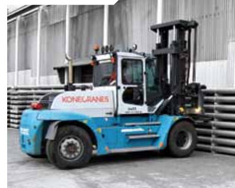
Twin empty stacker, Germany