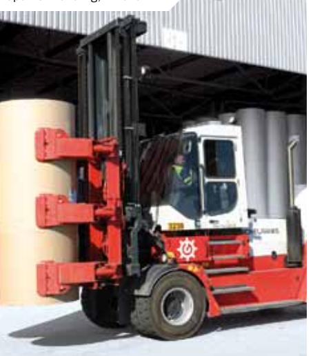
Paper roll handling, Finland